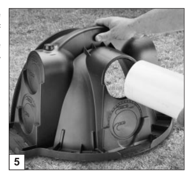
Insert inlet pipe.

5. Insert the inlet pipe into the end cap at the beginning of the trench. Extend the pipe into the end cap roughly 4 inches. (Screws optional.)