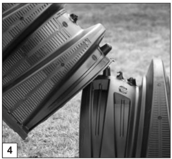
Connect the chambers.

8. The last chamber in the trench requires an end cap. Lift the end cap at a 45degree angle and insert the connector hook through the