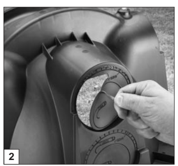
Pull tab on tear-out seal.

2. Pull the tab on the tear-out seal to create an opening on the end cap.