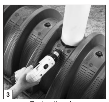
Fasten the pipe.