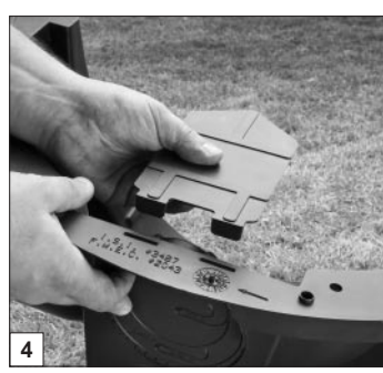
Install splash plate.

5. Insert the inlet pipe into the end cap at the beginning of the trench. Extend the pipe into the end cap roughly 4 inches. (Screws optional.)