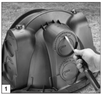
Start tear-out seal.

1. With a screwdriver or utility knife start the tear-out seal at the appropriate diameter for the inlet pipe. The seal allows for a tight fit for 3-inch, 4-inch SDR35, and 4-inch SCH40 pipe.