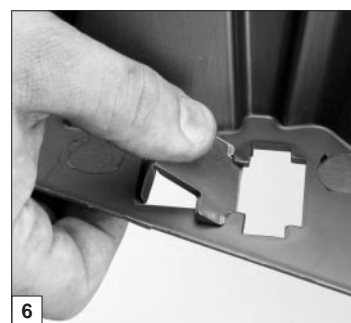
Activate StraightLock™ Tabs.