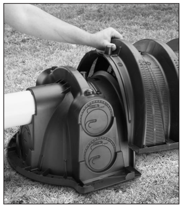
Quick4<sup>™</sup> Equalizer<sup>®</sup> 36 Chambers